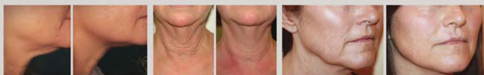
• Before • After • Before • After • Before • After